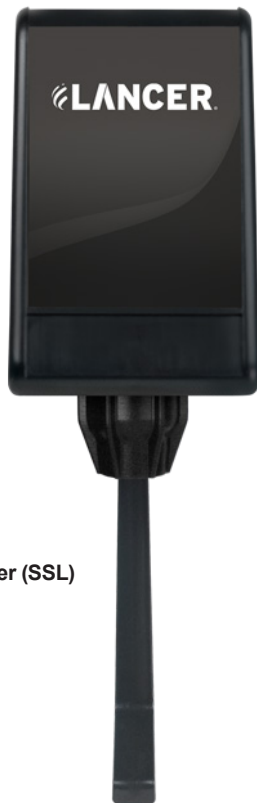
VersaPour Self-Serve Lever (SSL)

Push Button (PB) Portion Control (PC) Crew-Serve Lever Self-Serve Lever (SSL) Easyfill (EF)