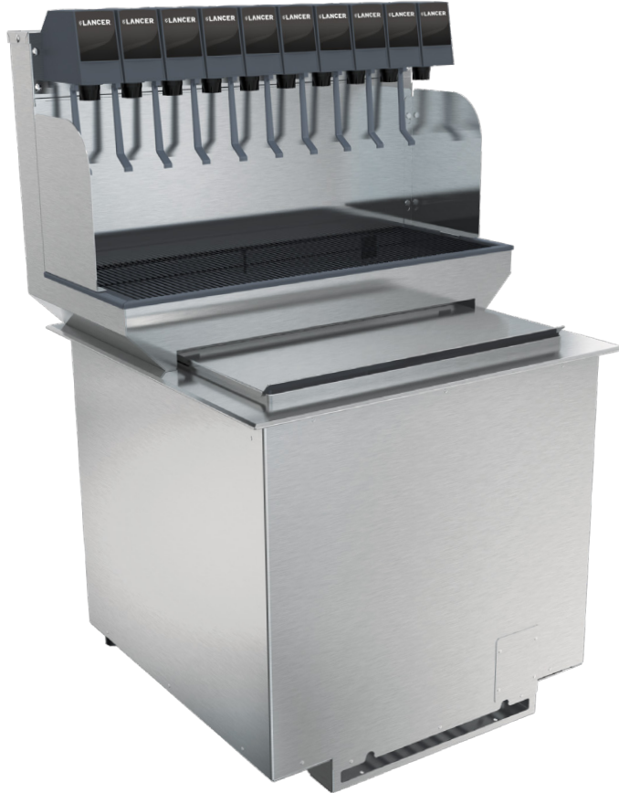
ICDI 2323 10vl