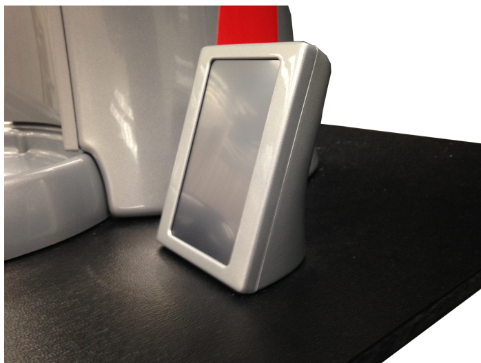
Counter Cutout For ADA Panel