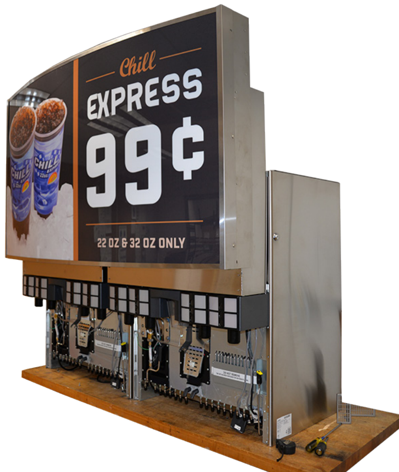
82-5048 - IBD 60" LED Merchandiser Assembly

Lancer has developed a new and improved LED Merchandiser Assembly for our 60 inch beverage dispensers. The new and improved frame design provides a more safe and secure method of installation and works for both the Flavor Select and IBD 4500 units. The large 60 inch by 34 inch display is the largest merchandiser for both the FlavorSelect and IBD units and utilizes a cleaner, safer, and more energy efficient option than any fluorescent bulb display. For more information on the new LED Merchandiser Assembly or installation instructions (Lancer PN: 28-0967) visit lancercorp.com or contact your Lancer Customer Service Representative