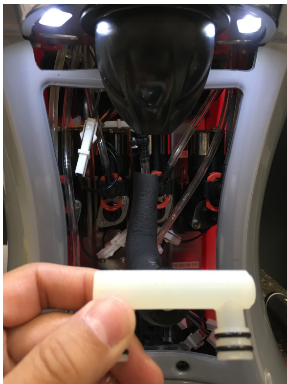
Remove Existing Plumbing Assembly

Lancer has developed a new plumbing assembly for the Bridge Tower unit to increase carbonation on some units that exhibit low carbonation. The new plumbing assembly is easy to install on-site, simply remove the existing plain and carbonated water plumbing assembly from the nozzle and water valves then install the new and improved plumbing assembly in its place. For more information on installation instructions (Lancer PN: 28-0965) visit lancercorp.com , scan the quick response (QR) code below, or contact your Lancer Customer Service representative. The new assembly will increase the carbonation levels and overall drink quality of your Lancer Bridge Tower. Contact your Lancer Customer Service Representative for more information on the new Lancer Bridge Tower Plumbing Assembly.