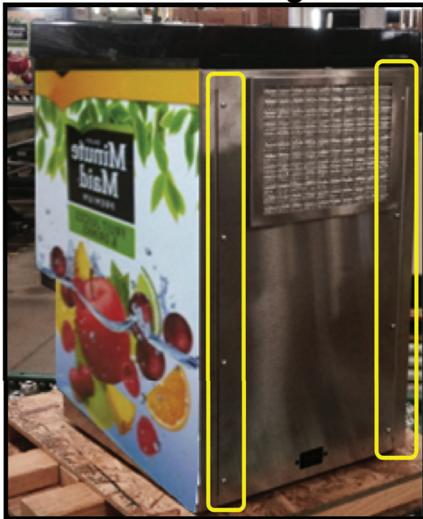
3 PC Wrapper

(Screws to assembly back side wrapper – 8 Total)