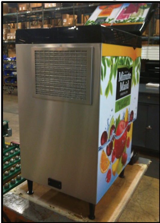
1 PC Wrapper