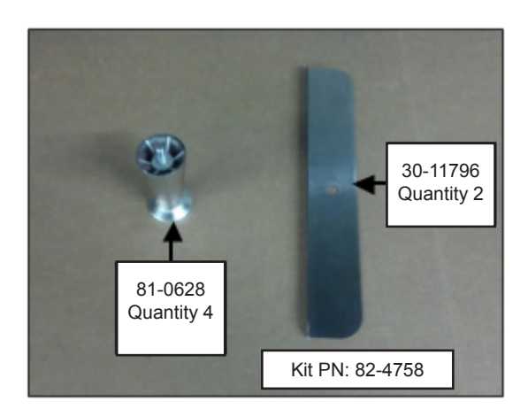
NOTE: Before installation, remove cladding to avoid damage.

<u>MARNING</u> TO AVOID INJURY OR DAMAGE TO THE UNIT, IT IS RECOMMENDED THAT A MECHANICAL LIFT IS UTILIZED FOR PROPER INSTALLATION AND A MINIMUM OR TWO (2) INSTALLERS ARE REQUIRED. ALWAYS USE PROPER LIFTING TECHNIQUES.