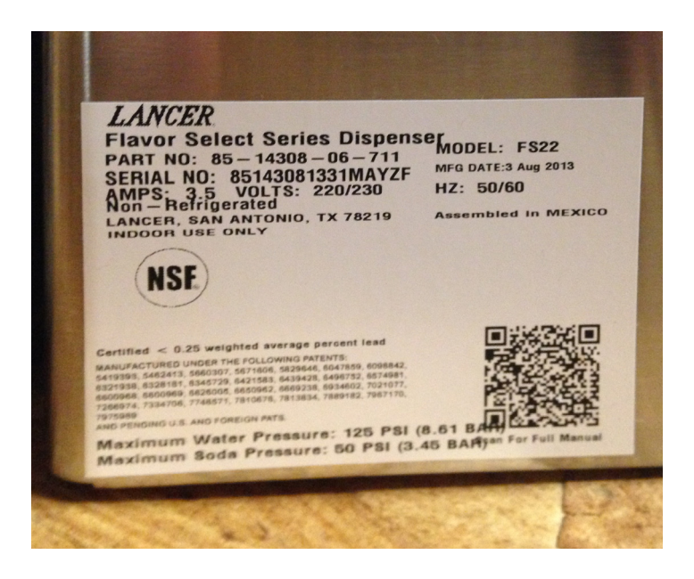
NAME PLATE LABEL ON SIDE OF UNIT

This quick, convenient, and environmentally responsible process will be fully implemented over the course of the year and will provide all of our customers, distributors, and installers easy access to all of our Technical Documents.