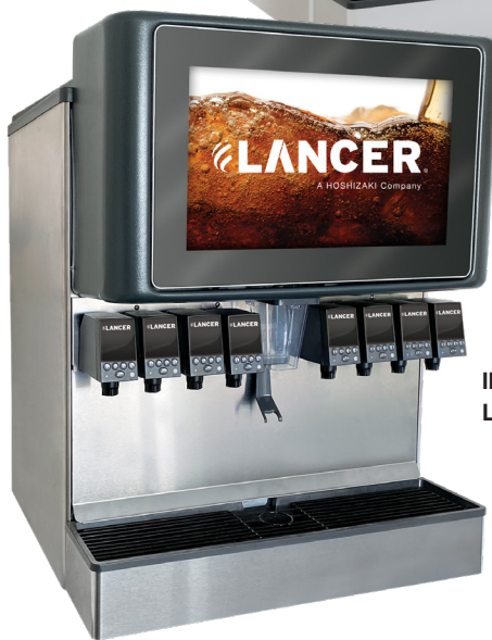
IBD 30 with LCD Merchandiser